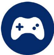
Technology, Gaming, & Esports