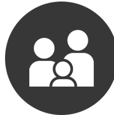
Matrimonial and Family Law