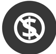
Restructuring & Insolvency