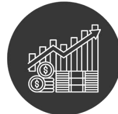
Capital Markets and Investment Law