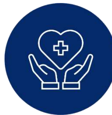
Health & Medical