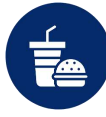
Lifestyle and F&B