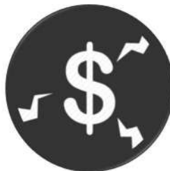
Bankruptcy & Insolvency