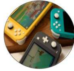
Gaming & Entertainment