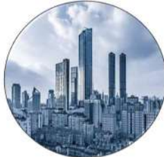
Corporation & GCG

We provide multi-legal services related to these eight core practice areas.